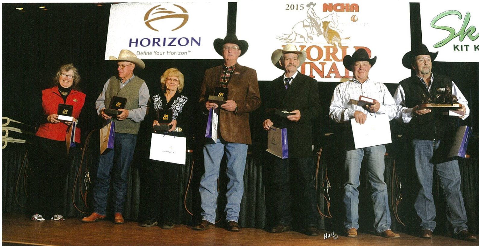
Champions of the inaugural Horizon Yachts Senior World Tour were honored at the 2015 NCHA World Champions Party during the NCHA Futurity.