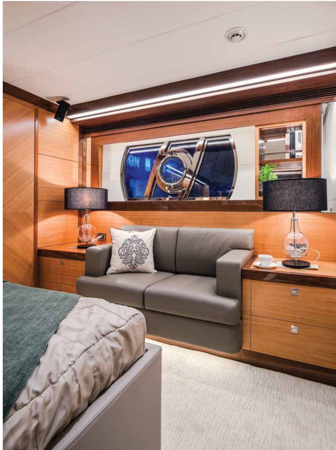
A plush settee in the master exemplifies Horizon's commitment to both livable comfort and modern design.