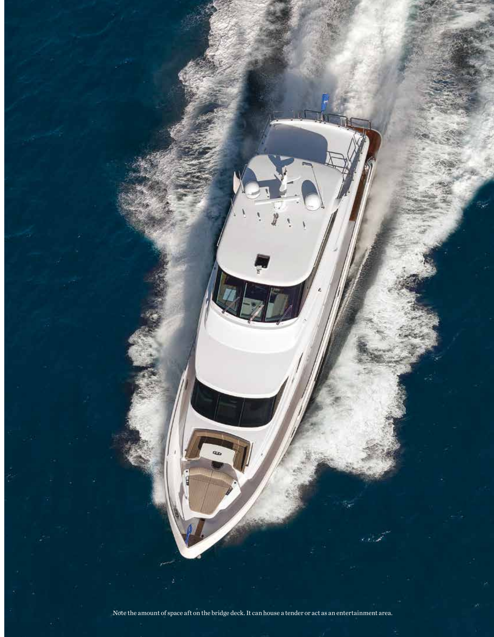
Note the amount of space aft on the bridge deck. It can house a tender or act as an entertainment area.

THE HORIZON E75 CONTINUES THE COMPANY'S TRADITION OF BUILDING SERIOUS CRUISING BOATS WITH AN EYE TOWARD FUN. BY KEVIN KOENIG