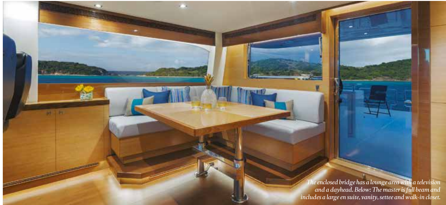
The enclosed bridge has a lounge area with a television and a dayhead. Below: The master is full beam and includes a large en suite, vanity, settee and walk-in closet.