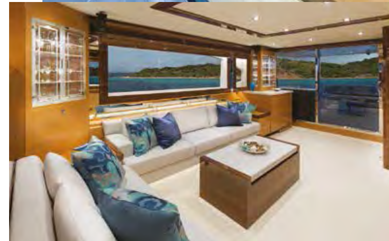
The salon (above) is aft of the country kitchen that extends to a dining table under the forward windows (right). The design offers an abundance of storage, including two refrigerators and a trash compactor.